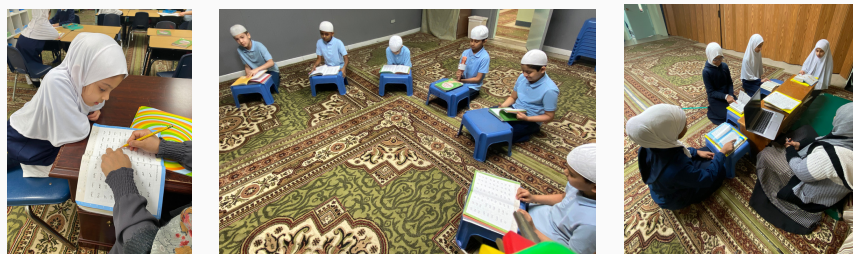
Students learning, practicing and perfecting the Quranic recitation!