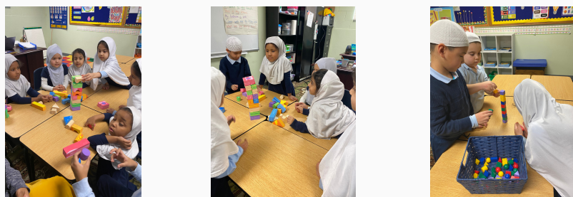
How Tall Before Fall? Little architects exploring engineering as they collaborate and build block towers – discovering how tall before the delightful tumble.

Hands-on math learning in kindergarten is crucial as it engages young minds through tangible experiences, fostering a deeper understanding of abstract concepts. Kindergartners sorting shapes, creating a foundation for a lifetime of discovery.