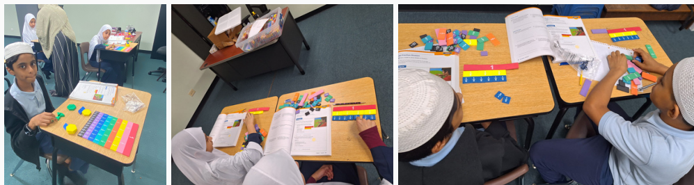
Sixth graders exploring the world of fractions with fraction strips, mastering the art of mathematical concepts.

“I really enjoy the work environment at Makki Educational Academy and how we build together as a community. My time as an Islamic Studies teacher at MEA has been amazing so far!”